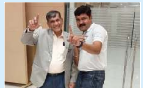
Dance Groove by DG