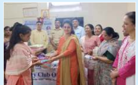
Visit to District Jail wherein WOMEN PRISONERS are jailed.