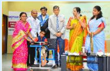
Donation of customized Cycle to Handicapped