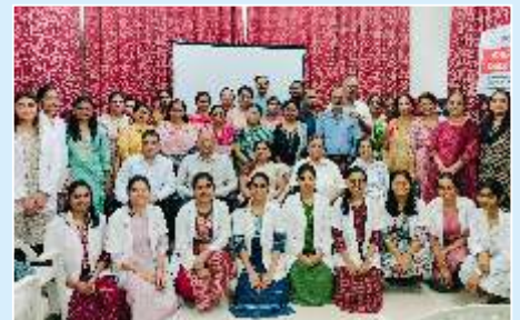
Visit of Pathologists to Rotary Redcross Thalassaemia Centre (RRTC)