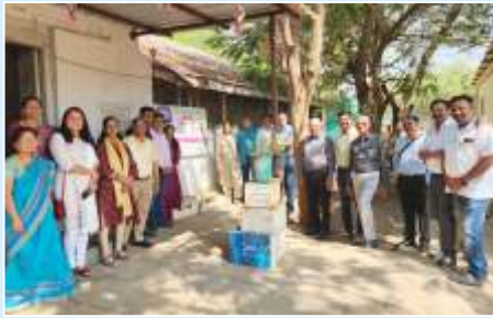
Visit to Rotary Annapurna Kitchen