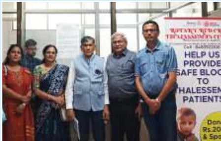
Visit to RRTC