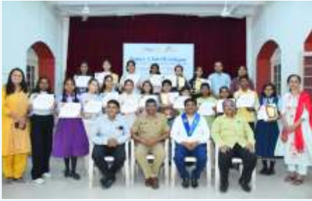
14th March - Prize distribution ceremony of DRAWING COMPETITION held on Traffic Safety