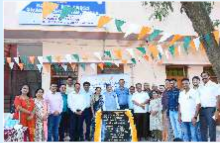
Inauguration of Beautification Work at Swagati School