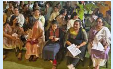
28th March - Monthly FELLOWSHIP DINNER held at Hotel Madhuban with games.