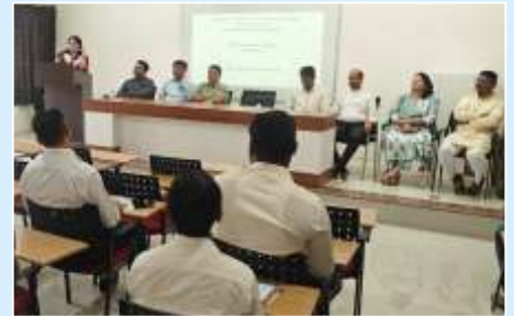
Survey undertaken for ROTARY ANNAPURNA BENEFICIARIES with the help of MSW students.