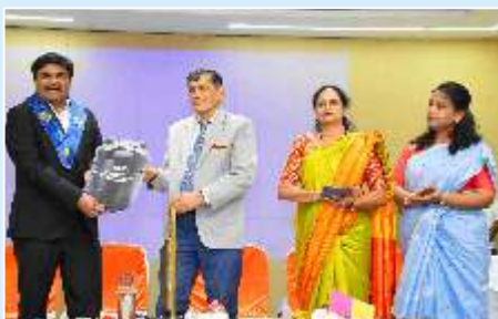
Symbolic Donation of Water Tank