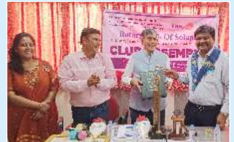
Inspection of Records