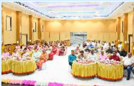
Dignitaries and Member Anns