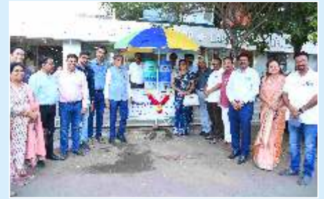
Inauguration of Pan Poi