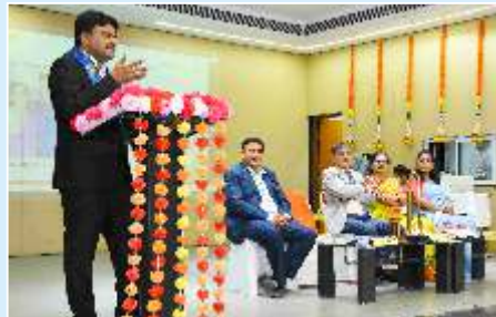
Address by President