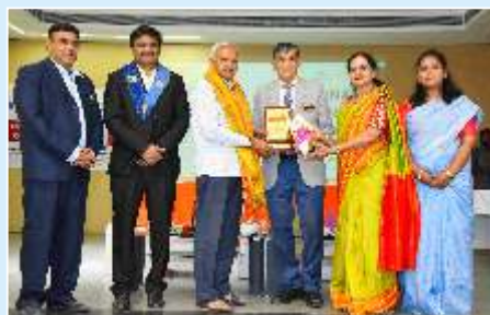
Vocational Service Awards