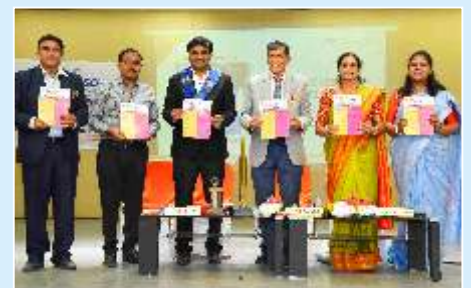
Release of Special Edition of Rainbow