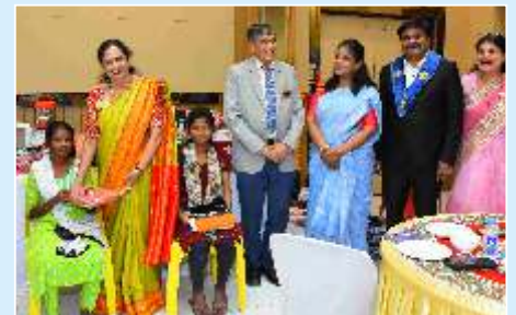
Donation of Household Items to Newly Wed Girls